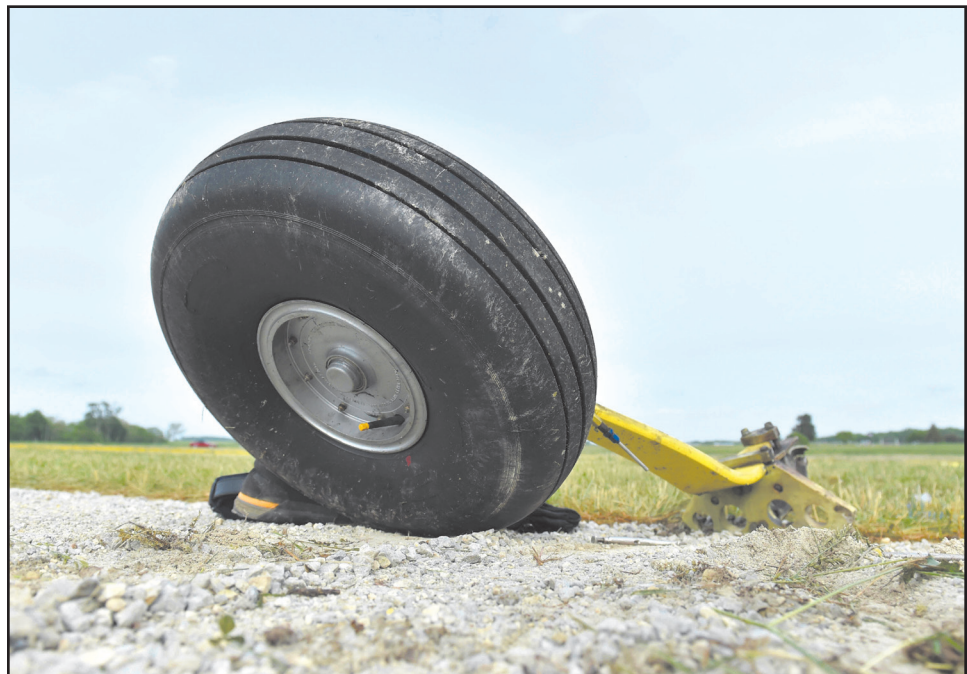
One of the tires from a crop duster rests on the ground after the plane crashed Thursday morning south of Grand Lake.