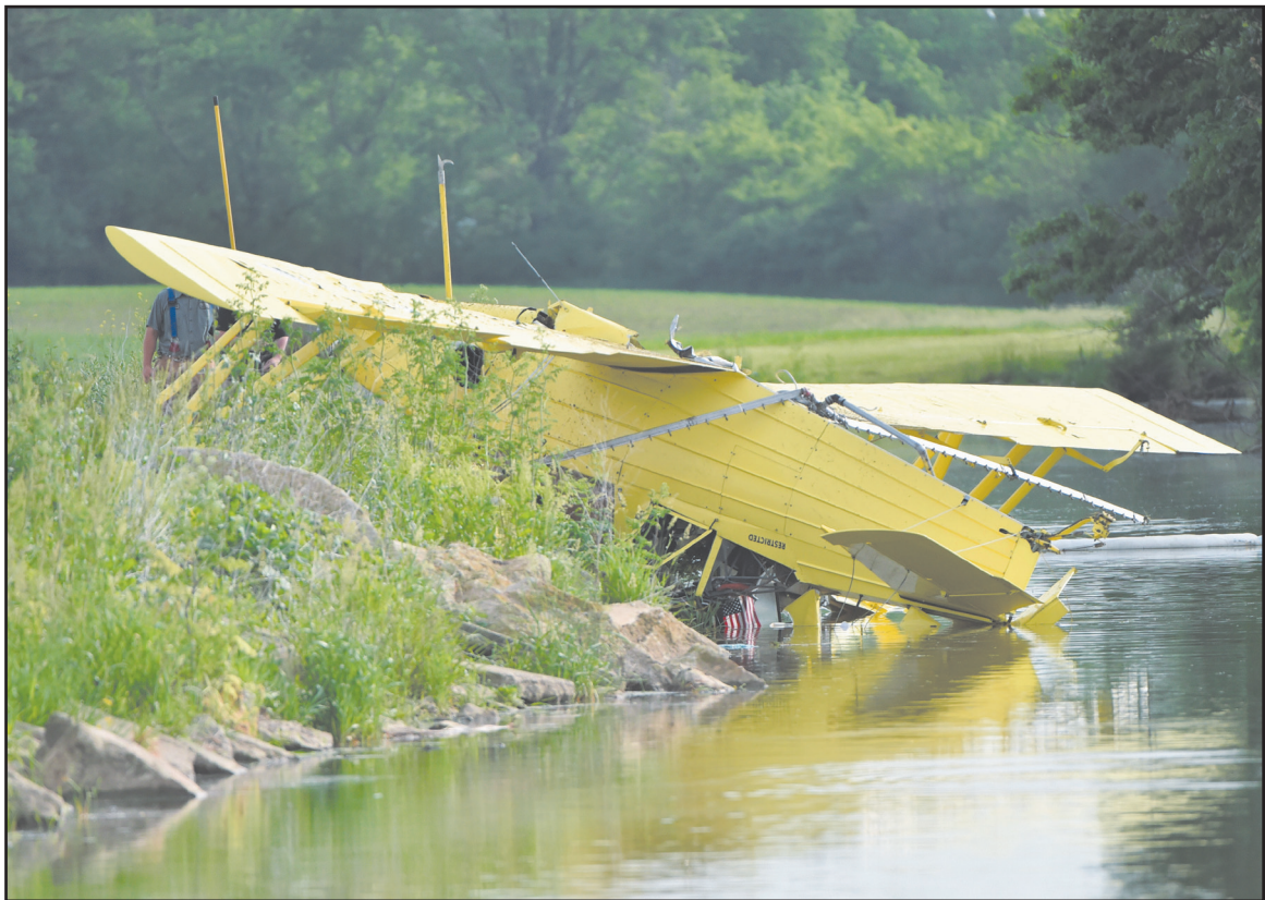
The tail of a crop duster rests in Beaver Creek south of Grand Lake Thursday afternoon. The plane crashed shortly before 8 a.m. not long after taking off from Lakefield Airport near Montezuma.