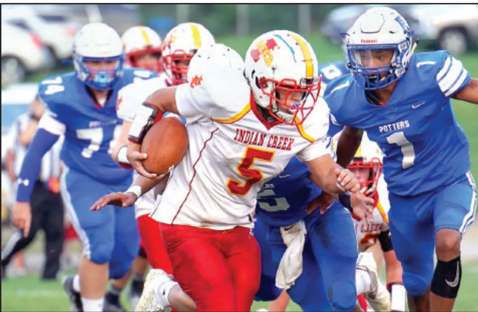
Jimmy Joe Savage

RUNNING HARD — Indian Creek's Jayden Irizarry runs past East Liverpool defenders in Friday night's Buckeye 8 North Conference match up.