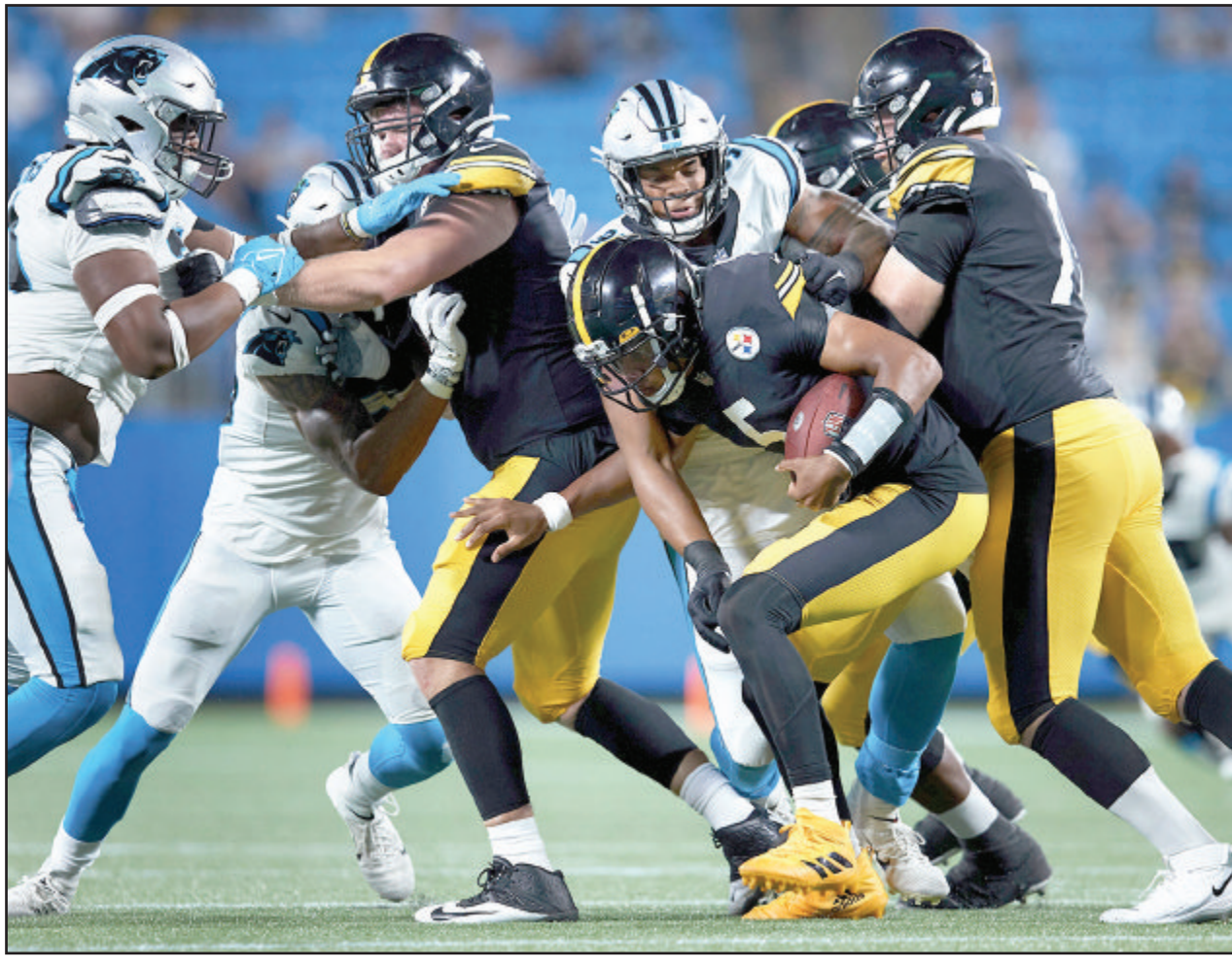
SACKED — Pittsburgh Steelers quarterback Joshua Dobbs is sacked by Carolina Panthers defensive end Yetur Gross-Matos during an NFL preseason football game, Friday, in Charlotte, N.C.

With this being the Steelers' fourth preseason game — most teams played three — coach Mike Tomlin rested all but four starters, including quarterback Ben Roethlisberger, wide receivers JuJu Smith-Schuster and Diontae Johnson, and running back Najee Harris. Even backup QB Mason Rudolph got the night off.