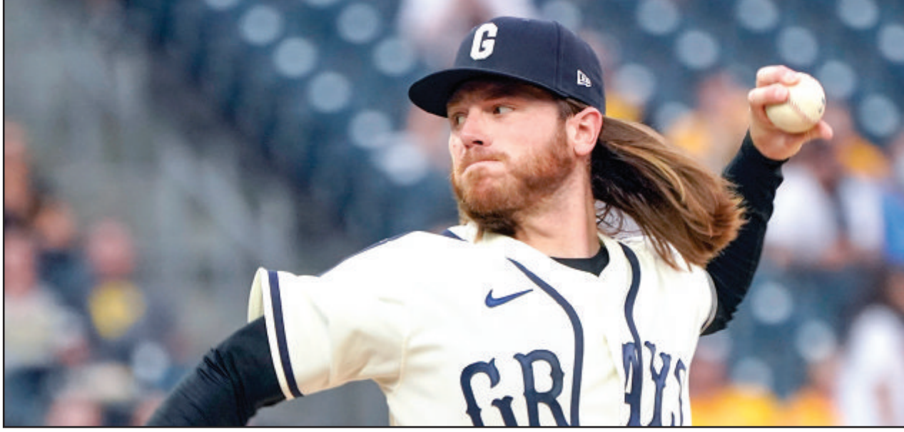
GETTING THE START — Pittsburgh Pirates starter Dillon Peters pitches against the St. Louis Cardinals in the first inning Friday's game in Pittsburgh.

Happ (8-6) improved to 3-0 with a 2.22 ERA in five starts with the Cardinals, allowing two runs on three hits in 5 2/3 innings