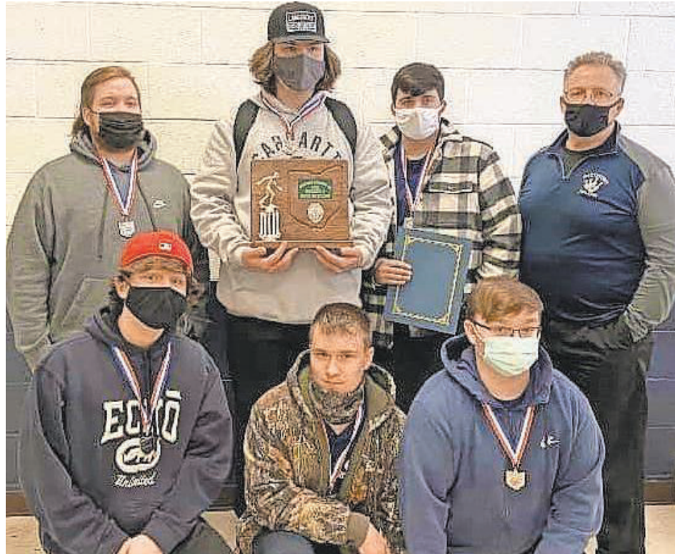
The Rootstown boys bowling team qualified for the Division II state tournament.