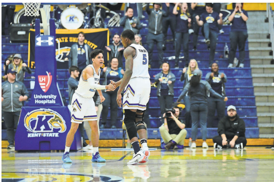
The Kent State men's basketball team has already qualified for the eight-team Mid-American Conference Tournament, which will begin March 11 in Cleveland. The Golden Flashes women's squad has also made the tourney field.