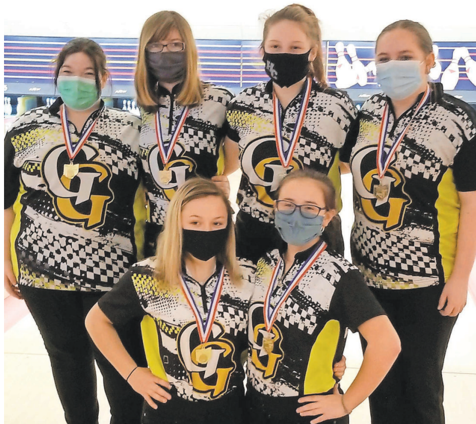
The Garfield varsity bowling team celebrates following its Division II district championship.