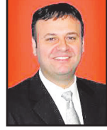
TINO MERLO TOYOTA OF WARREN

N.Y. Giants at Washington New Orleans at Carolina Cincinnati at Chicago Houston at Cleveland L.A. Rams at Indianapolis Denver at Jacksonville Buffalo at Miami New England at New York San Francisco at Philadelphia Las Vegas at Pittsburgh Minnesota at Arizona Atlanta at Tampa Bay Dallas at L.A. Chargers Tennessee at Seattle Kansas City at Baltimore Detroit at Green Bay