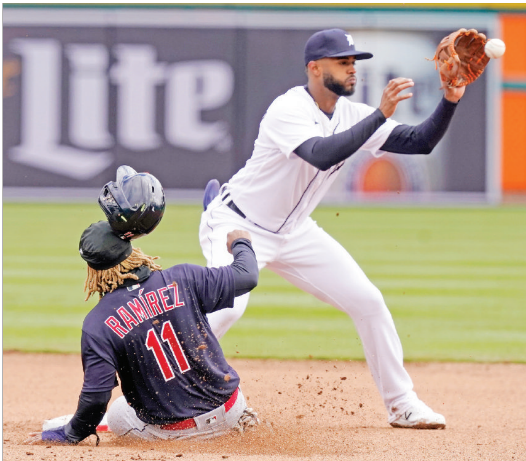
The Indians' Jose Ramirez loses his helmet while sliding into second base against Detroit's Jonathan Schoop.