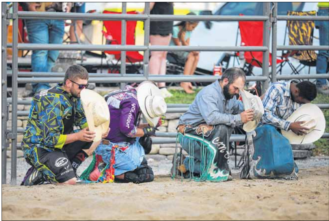
Bull riders kneel and remove their hats during the National Anthem on Friday at the Auglaize Fair.