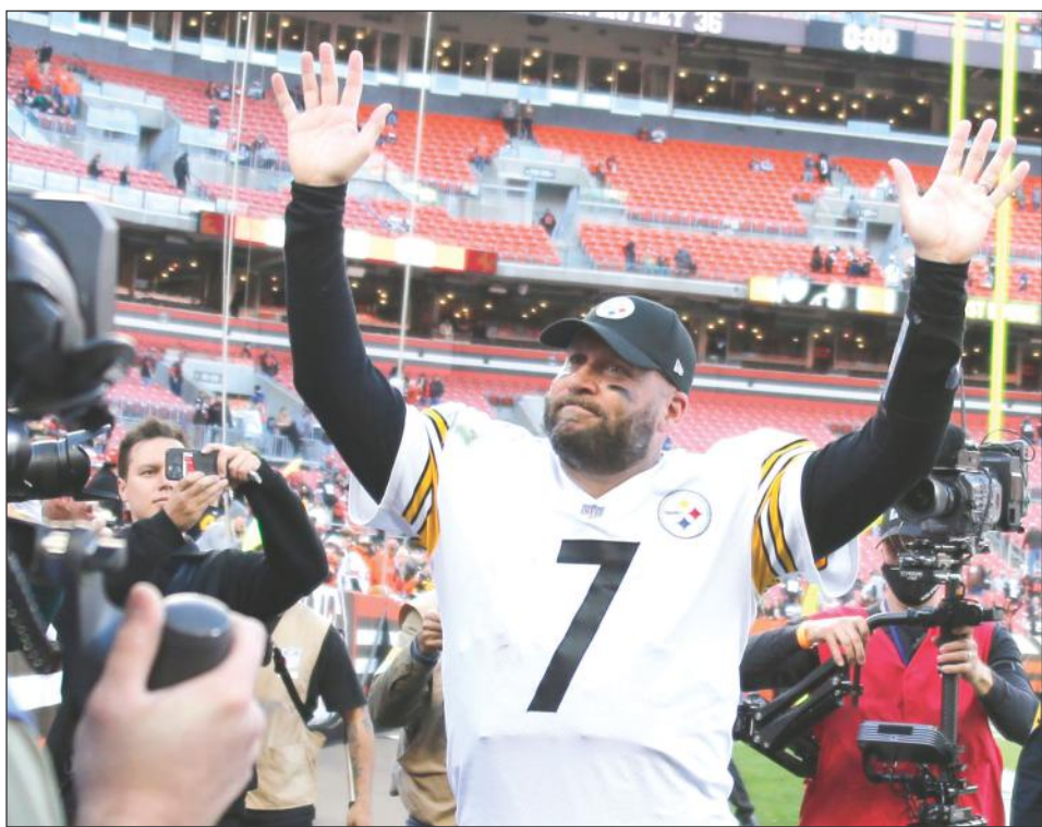
Pittsburgh Steelers quarterback Ben Roethlisberger celebrates after the Steelers defeated the Cleveland Browns 15-10 Sunday in Cleveland.