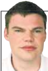
DAVID BRIGGS MIRRORS OF SPORT