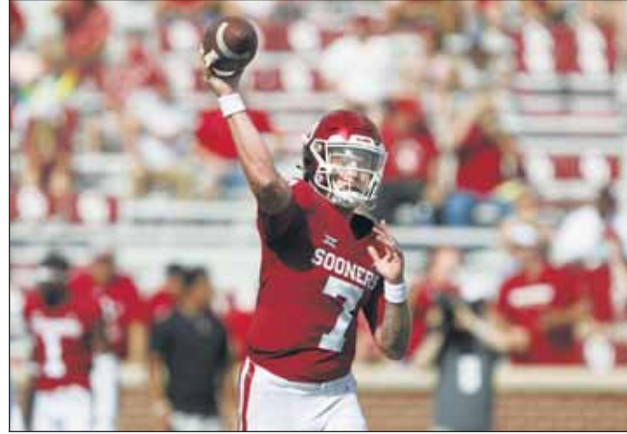
Oklahoma's Spencer Rattler threw for 304 yards and a touchdown in the Sooners' win over Tulane on Saturday.

Iowa State was in danger of joining Michigan as the only top-10 team to lose to an FCS opponent, recalling the Wolverines' memorable upset by Appalachian State in 2007.